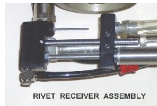
RIVET RECEIVER ASSEMBLY

10" or 12" rotary bowl feeder blow feeds rivets to rivet setting tool. Bowl holds up to 12 lbs. of rivets.